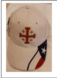
Style 4 White W/O Shell