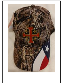
Style 6 Camo W/Cross