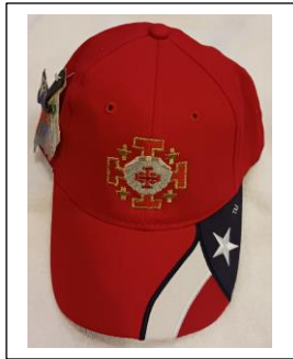
Style 1 Red W/ Shell