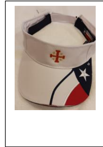
Style 5 Ladies Visor W/O Shell