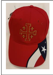
Style 3 Red W/O Shell