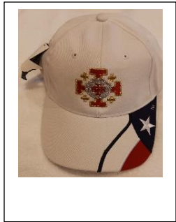
Style 2 White W/ Shell